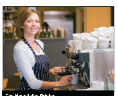
The Hospitality Printer ► High Speed ► Logos and Coupons ► Increases Counter Space ► Voice Enabled